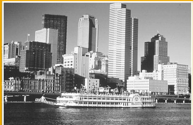
The Magestic River Boat cruising on one of Pittsburgh's three rivers, the Monongahela River.