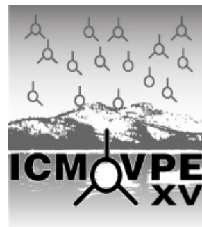
Exhibit Area Information