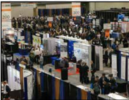
Exhibit at the anchor meeting of the minerals, metals, and materials community: TMS annual meeting programming spans the entire materials life cycle.

TMS2017 welcomes two co-located international meetings, the 3rd Pan American Materials Congress and Energy Materials 2017 , co-sponsored by the Chinese Society for Metals, which will bring a strong industrial presence and give you the chance to reach the world in one convenient location.