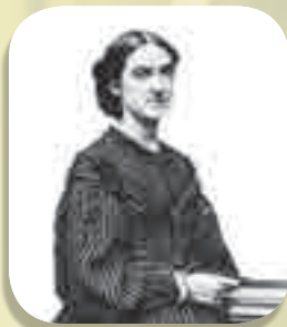
Ellen Swallow Richards

The TMS Frank Crossley Diversity Award annually honors an individual who has “overcome personal, professional, educational, cultural or institutional adversity to pursue a career in minerals, metals, and/or materials,” and includes a $1,500 cash prize.