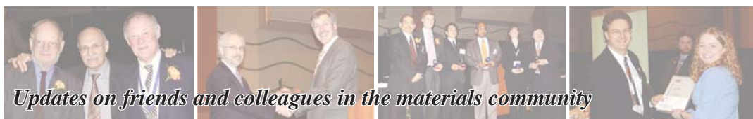
Updates on friends and colleagues in the materials community