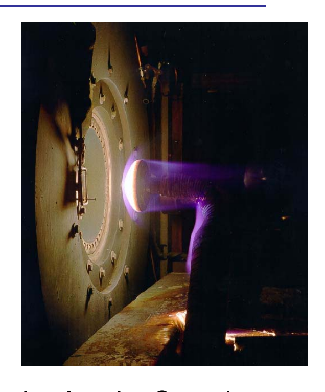
Ames IHF Facility, one of several in the Arc Jet Complex

Ames arc jets have played a role in the development of almost every NASA TPS since the Apollo era