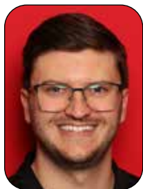
FEATURING KEYNOTE SPEAKER Bryce Wilcox , Milwaukee Tool

The 8th World Congress on Integrated Computational Materials Engineering (ICME 2025) serves as a pivotal platform uniting leading researchers, practitioners, and stakeholders to exchange cutting-edge knowledge and advancements in the discipline. As the primary nexus for interaction among software developers, process engineers, materials scientists, and engineers across the production chain, ICME 2025 addresses integration priorities and identifies gaps crucial for advancing the field.